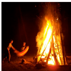
"You can see our campfires from space"