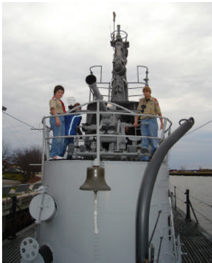
Scouts on the deck of the U.S.S. Cobia in Manitowoc (more photos on page 2 and at www.troop222bsa.org )

On March 30–31, 17 scouts and adults went to Manitowoc to tour and "sleep" over one night on the U.S.S. Cobia. This is an authentic World War II submarine docked on the Manitowoc River just outside of the Wisconsin Maritime Museum. Oh, and we did tour such museum too and drank some Torpedoe Juice (can't explain, you gotta ask someone who was there). On our less than 24 hours adventure, we also went to the Point Beach Nuclear Power Plant visitors center to learn a bit about nuclear power, electricity, etc.